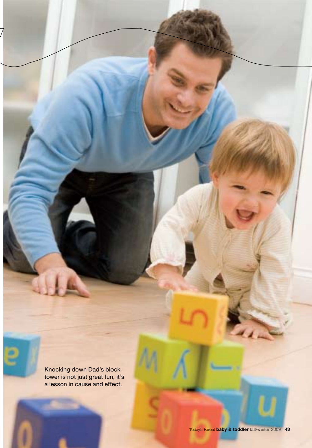
Knocking down Dad's block tower is not just great fun, it's a lesson in cause and effect.

Chaos to construction Toddlers are passionately interested in how things go together — and they learn this by taking them apart. Your toddler will scatter her blocks or cars before she gets interested in stacking or lining them up; she will undress herself before she can manage dressing, and she will dump out everything in sight — laundry baskets, buckets of balls, wastebaskets — before she moves on to filling them up.